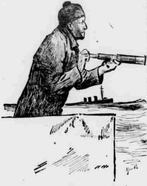
When you're on the lookout for submarines, a chew of Real Gravely helps to pass the long, dark hours.