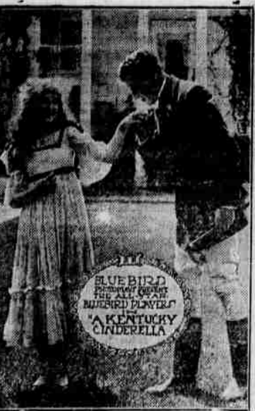
This Bluebird Feature will be on the program at the Star theater Saturday only.