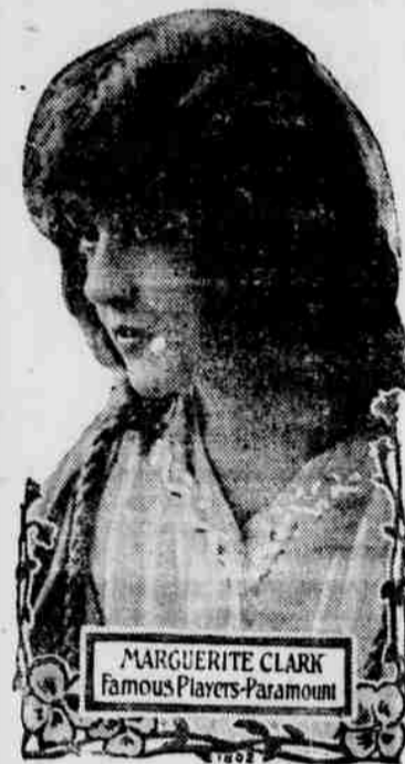
MARGUERITE CLARK Famous Players-Paramount In "Little Lady Eileen"

wishing books may have them by paying postage. A list of the "war books" will be sent anyone on application.