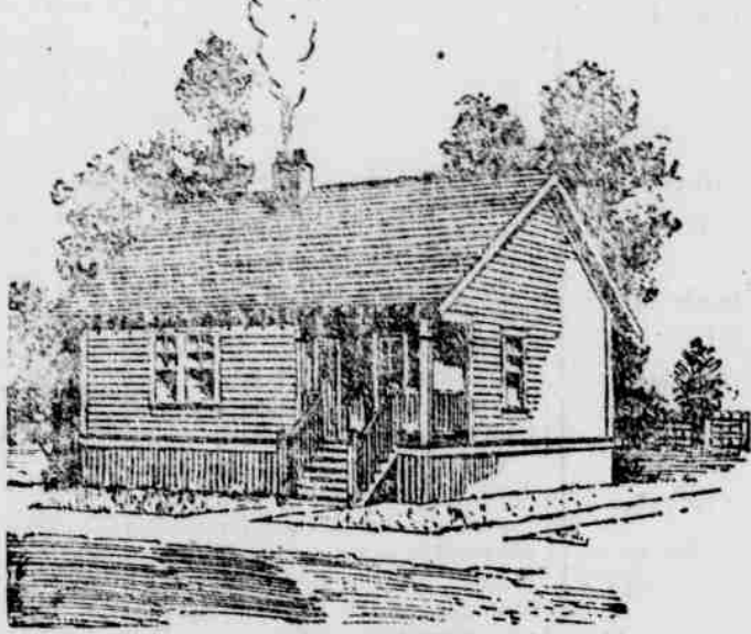
No. 490. FOUR ROOMS. 30 x 30.

In 1914 it took 680 bushels of wheat to buy this house In 1917 it takes 320 bushels of wheat to buy it.