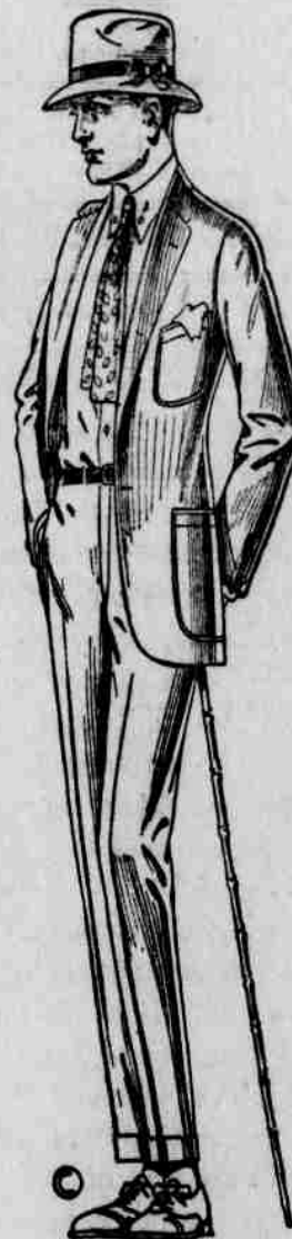
We're ready to take your measure NOW.

Every line of merchandise which we sell represents the very best quality we can procure. YOU come first with us because it's YOUR SATISFACTION that insures our success. When we selected the incomparable tailoring line of ED. V. PRICE & CO. we did so not solely from a matter of profit but because YOU would be suited best.