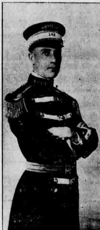
Clever Cornetist With Elks' Band.