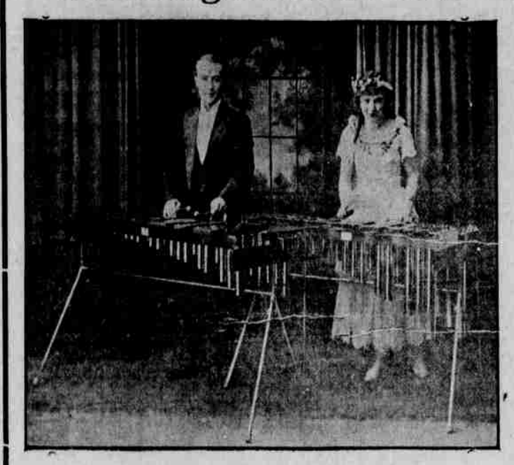
Marimbapdone, Xylophone and (larinet