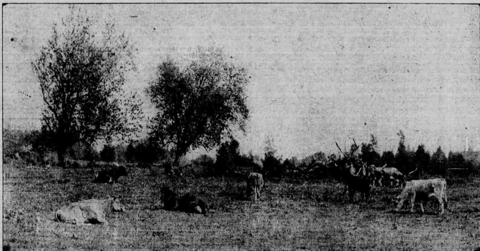
PLEASANT PASTURE LANDS IN EASTERN OREGON

The Pacific Northwest is rapidly acquiring some of the finest highways in the United States. Good roads shorten the distance to the market for the farmers and enhance the value of the lands they traverse. Multnomah County, Oregon, voted for good roads April 14, when a majority of nearly 14,000 people authorized an issue of $1,250,000 in bonds to pay for improving 70 miles of the county's principal trunk highways with modern hard-surface pavement for permanent use. This in a year of so-called "business depression."