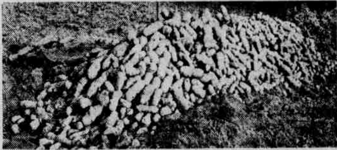
PIT OF POTATOES GROWN IN KITTITAS COUNTY.

The Winters in this valley are entirely free from wind, the air being invariably quiet during cold weather. With the opening of Spring, and the consequent warming of the air in this and the lower valleys of the Yakima Valley and Columbia Basin, mountain air flows down to replace the rising atmosphere of the warmed area. The result is a great frequency of mountain winds during Spring and early Summer. These winds occur