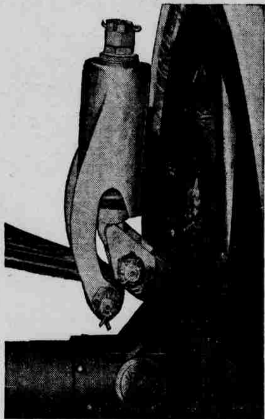
PREVENT SPRING BREAKAGE