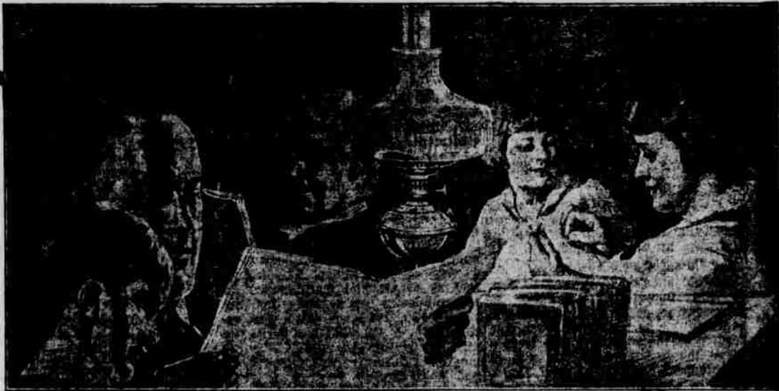
Showing Aladdin Table Lamp Style (101-A) in Use —There's an Aladdin style for every place and purpose.

Better than Electric—But Uses Less Oil than an Old Style Lamp