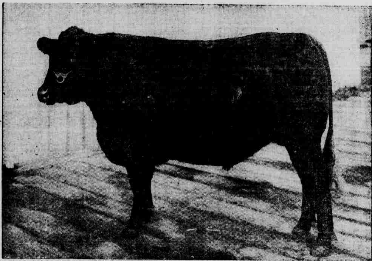
GRAND CHAMPION PET STEER AT PORTLAND INTERNATIONAL LIVESTOCK EXPOSITION, POLLED ANGUS BREED, WEIGHT 1650 POUNDS; SOLD AT 24 CENTS A POUND. ENTERED BY IDAHO AGRICULTURAL COLLEGE.