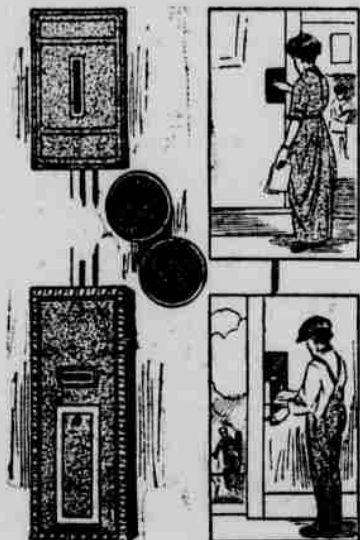
Units Used in Novel Call System for Expressmen.

Each tenant in a new office building in New York is provided with a number of small metal disks or checks, each