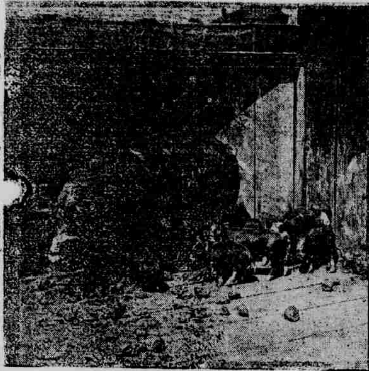
Yorkshire Sows at Oregon Agricultural College Stock Farm.

Swine breeders, like breeders of other kinds of livestock, are usually to the manor born. Acuteness of observation, judgment to determine what will happen before it does happen (this judgment based on a well-grounded knowl-