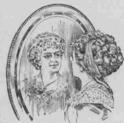
Kryptok Lenses do not mar good looks.