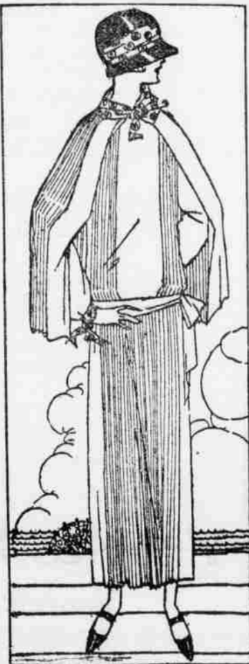
Frock of Plaited Brown Crepe, With Short Cape to Match; Trimmings of Printed Silk to Tone in With General Color Scheme.

The little cape is indicative of the present mode. Women are finding out how useful a garment of this sort can be. They are rejoicing in its possibilities of offering a slight covering for the frock along with its tendency to give to the costume a more formal sort of appearance. This little, short cape has plaited sections over the sides; and the back section, along with portions on either side of the front, is left plain. Then there is a collar made