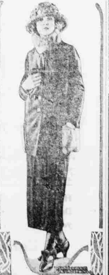
Brown duvetine and squirrel form the winter features of this charming suit for young ladies who wish to be comfortably and fashionably dressed.