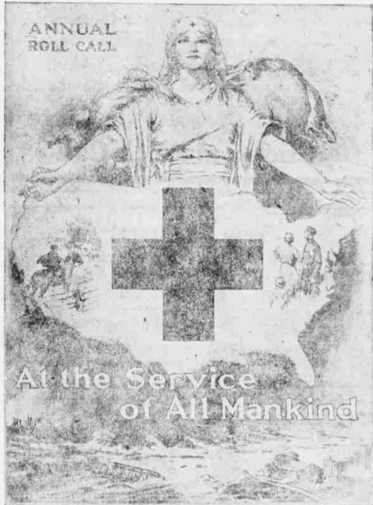
AN ALLEGORICAL concept of the Red Cross as a peace-time ideal is employed by the American Red Cross in a new and striking poster for its Annual Red Cross Roll Call. Spread out before the heroic side figure is the outline of the United States with a Red Cross superimposed upon it while around its borders are sketched scenes depicting the chief activities of the Red Cross today—service to disabled veterans of the World War, disaster relief and promotion of the public health. The poster is the work of Lawrence Wilbur, a New York artist and will be displayed throughout the country during the enrollment of the Red Cross membership for 1923.