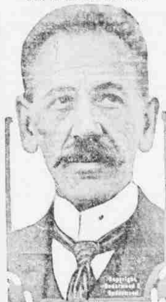
Dr. Jędrzej Moraczewski, former prime minister of Poland, who is now touring the United States addressing Americans of Polish ancestry.