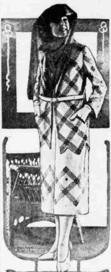
An interesting tailleur of white flannel is stitched in navy and worn with a small quatercorne of straw, swathed with blue chiffon.