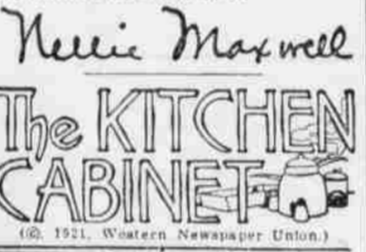
(© 1921, Western Newspaper Union.)

Lemon Dumplings.—Mix the grated rind and juice of a lemon with one cupful of molasses, one-half cupful of sugar, one tablespoonful of butter and one cupful of hot water, then add to this boiling mixture simple dumplings, using one egg, two teaspoonfuls of baking powder, one cupful of flour, one-half teaspoonful of salt and milk to make a drop batter. Cover closely and boil 20 minutes, using care that the mixture does not burn.