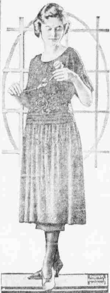
This smart costume of navy crepe de chine, studded with steel cut beads, and rose designs embroidered in beads, is popular with the younger element.