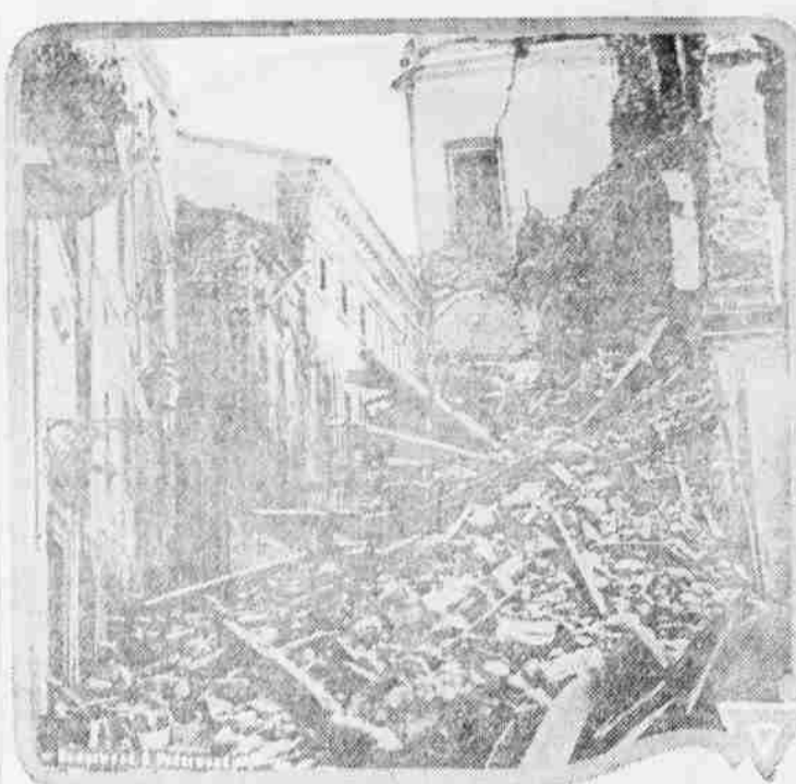
View of the main street of Livizzano, Tuscany, showing some of the ruin caused by the earthquakes which destroyed many towns in that section of Italy.

Professional trip to the mountainous district of southern Morrow county last week where he performed a major surgical operation. The operation was eminently successful, but, as sometimes happens, the patient—ah—died. The patient was a fine, big, fat buck deer, and again the Herald family had heat for dinner.