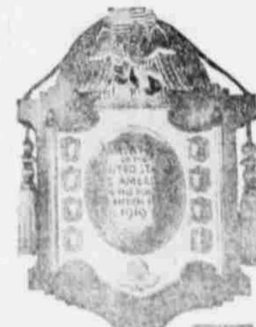
This is the handsome trophy which the Imperial Boxing Association of Great Britain is to present to the American forces as a memento of the great international boxing tournament which was held in London in December, 1918.

Some Colors You See. Egyptian designs and Egyptian colors are leaders for spring, and the dressmakers have gone back to real Egyptian prints and patterns for their inspiration, and the colors that seem to take precedence are chameleon, which is copper-ocher, a peculiar opaque blue, citron color and green. Then there is a second blue that suggests the turquoise. The green is sometimes combined with blue, but as a matter of fact it is lighter and possibly yellower than the color actually seen in Chinese jades.