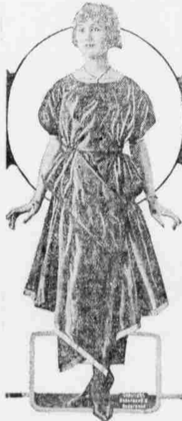
The skirt, hip design, and sleeves of this model all have peculiarities which make the dress distinctive. It is made of dark green taffeta with lighter bindings.

The slowness of the Jeanne file would be improved by a smartly draped frock of tulle taffeta and French blue ribbon. The front of the