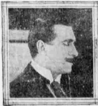
RUPERT JULIAN in "THE FIRE FLINGERS"