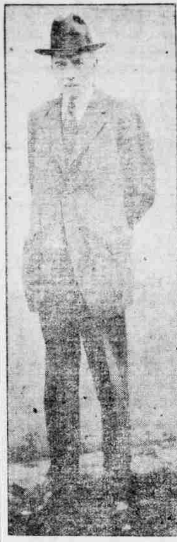
Dr. Livingston Farrand, the greatest authority on public health in America, served in France as the head of the fight against tuberculosis. He now succeeds Henry P. Davison as head of the American Red Cross. Dr. Farrand recently visited Seattle, Spokane and Portland and conferred with representatives of Red Cross Chapters of Alaska, Idaho, Oregon and Washington. "The Red Cross faces problems in the post-war period more serious, if possible, than the problems of the war itself. Not a great amount of money, but the membership and hearty co-operation of every American citizen is what is needed to help the Red Cross to solve these problems, which threaten our national vitality, and which, unless solved, will rob us of the fruits of victory," said Dr. Farrand.

"This is not a problem of protecting the big nations, for the few that remain can well look after themselves. What we have done is to set up a score of little democracies, and if the American people could visualize their handiwork they would insist with the same determination that they did in 1917 that our government proceed."