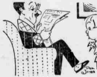
DESCRIBED. "Pa, what is red tape." "Red tape, my boy, is the government string to efficiency's pocket book."