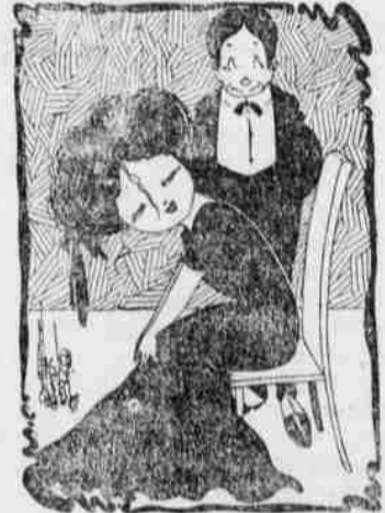
She (after the reception)—That man who sat next to me at the dinner had bad manners! He—Strange! I thought he had!