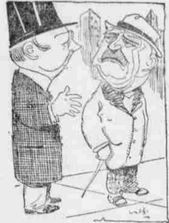
The Reformer—Do you think that statesmanship in this country is on the decline? The Politician—My boy, no statesman in this country would decline anything.