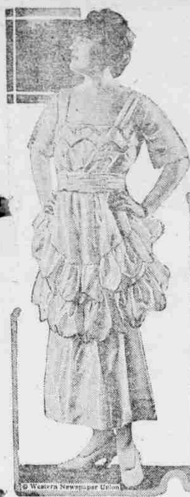
This charming outfit for the young lady is called the "petal frock," and is said to be a great favorite.