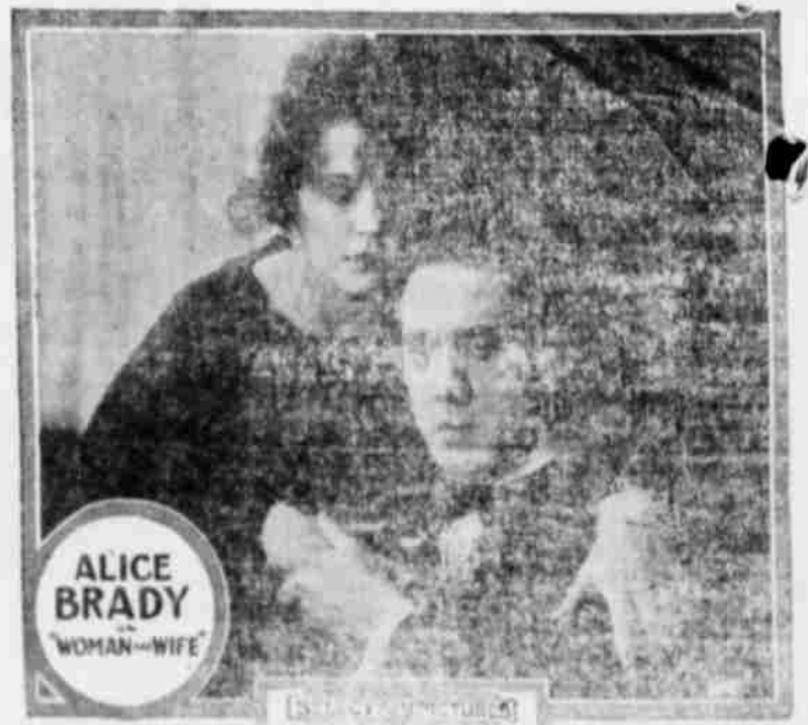
ALICE BRADY "WOMAN-WIFE"

Tues, April 29 Alice Brady in Woman and Wife