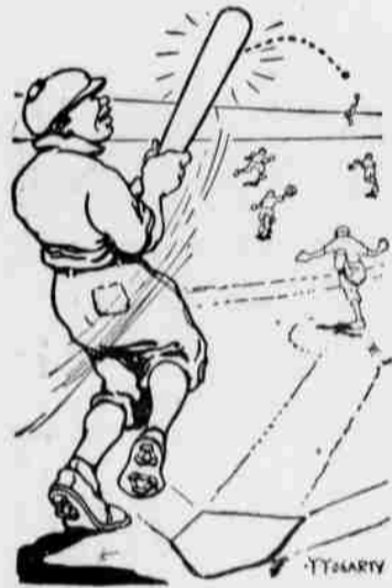
Blakeley Lined Out a 2-bagger in a pinch

the smoke had cleared away the game was won. Echo was let down without a hit in their last time at bat, the