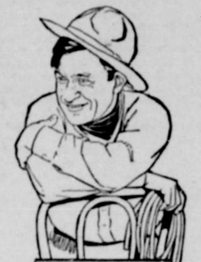
Another "Bull" Durham advertisement by Will Rogers, Ziegfeld Folies and screen star, and leading American humorist. More coming. Watch for them.

I see where some of the Foreign Nations say they are going to FUND their debt to America, and all the Papers are all excited about it. But the BULL'S EYE is a Paper that never misleads our readers (either one of them). FUNDING a debt means about the same thing as having a fellow that has owed you for years, come to you and say "I am going to make arrangements to take up that loan I owe you just as soon as I can collect it from some fellows who owe me." So don't by any means get FUNDING mixed up with PAYING. The two have nothing in common. These Nations are just stalling until another War comes along and the first thing you know our debt will be four Wars behind. We have enough saved up to fight again, but they are using it now to enforce Prohibition.