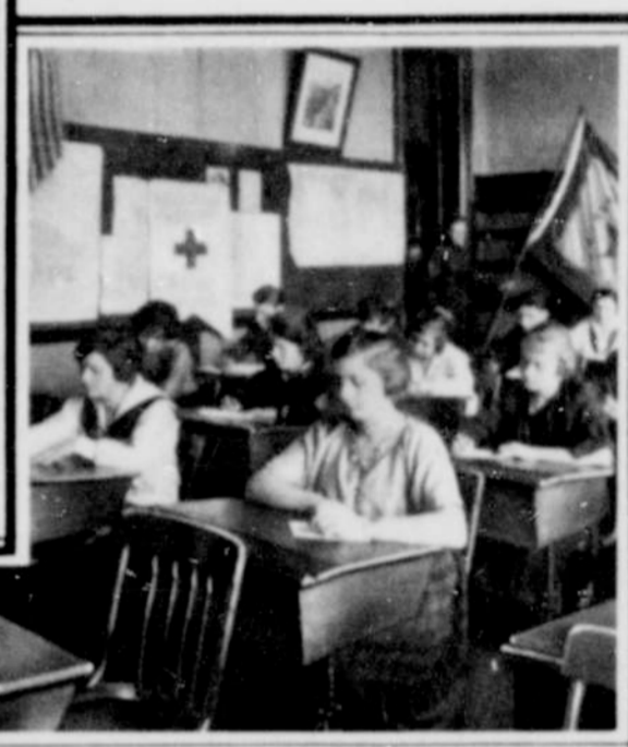
Girls and boys in a public school, all members of the American Junior Red Cross, writing to school children of another land—helping to weave world-wide ties of friendly understanding