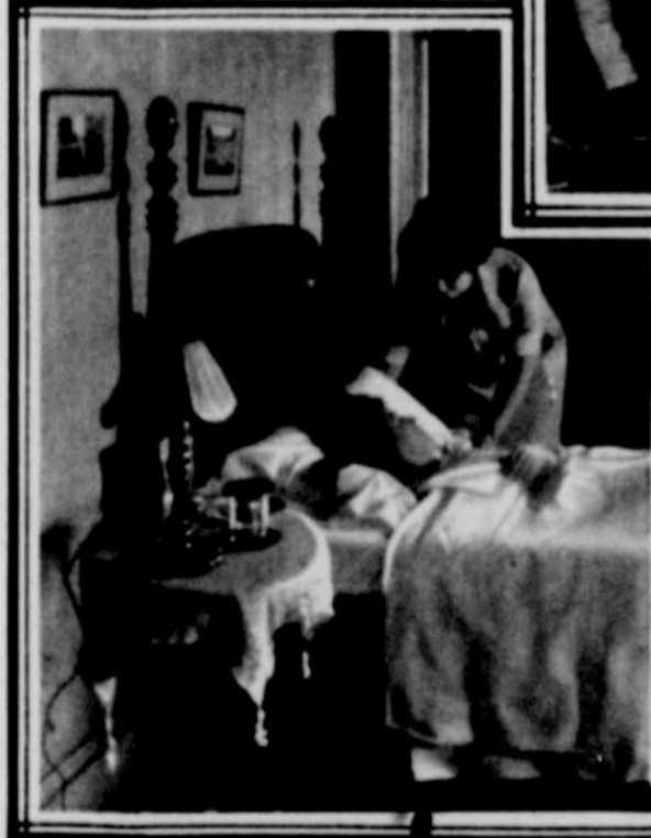
The girl by the bedside of her sister has been taught the essentials of caring for the sick in the home through a Red Cross Course in Home Hygiene and Care of the Sick