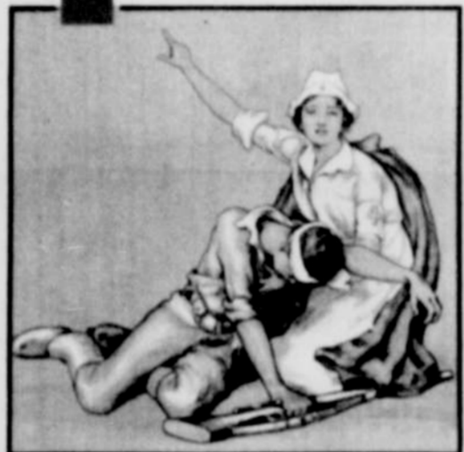
AMERICAN RED CROSS NURSING SERVICE