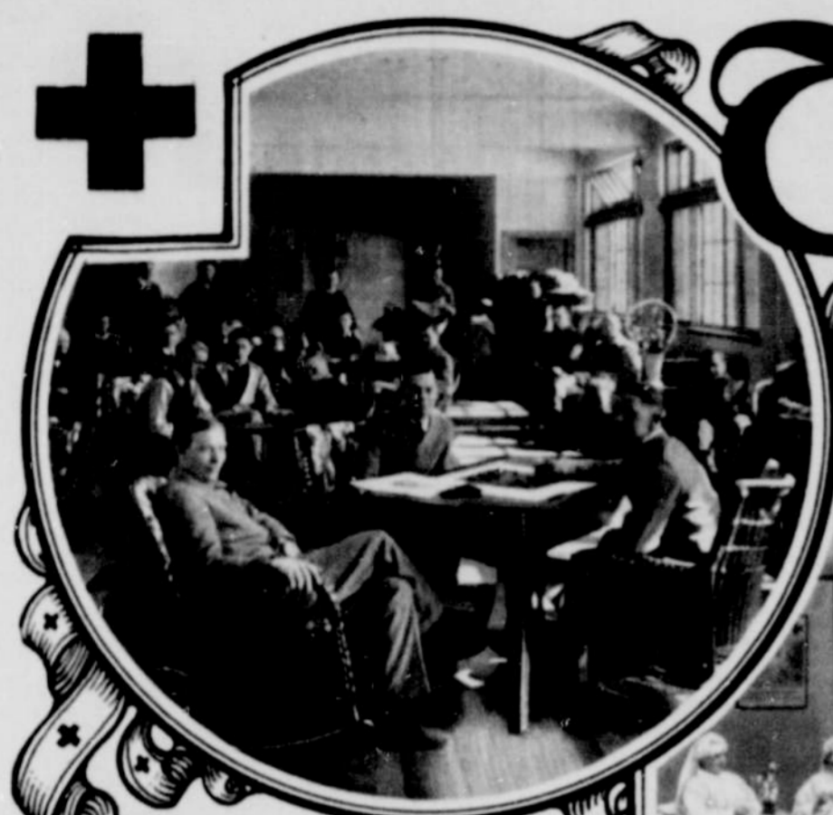
A recreation room in a U. S. Veterans' Bureau Hospital for disabled war veterans, supervised by the Red Cross—just one phase of Red Cross service to those who suffered in the world war