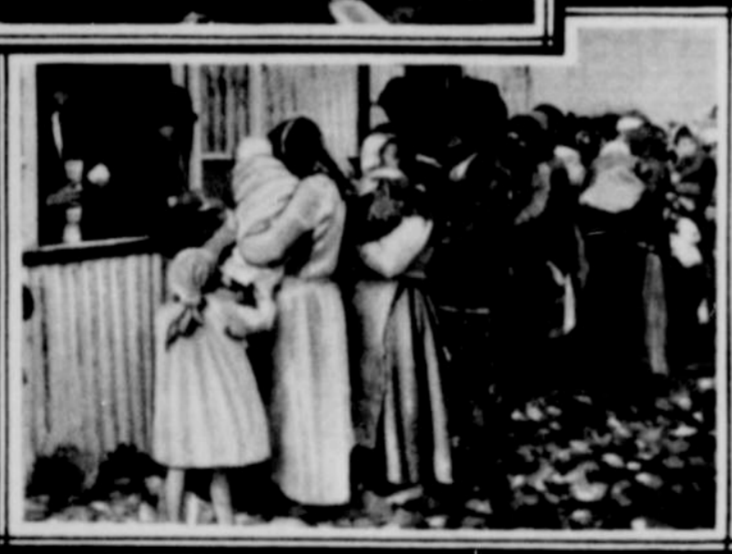
The American Red Cross lends a helping hand to people overtaken by catastrophe in other countries