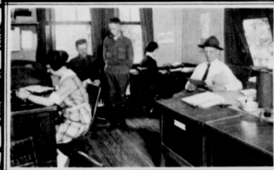
The Red Cross Field Director in Camp, Army Post and Navy Yard is father to the boys of the regular Army and Navy