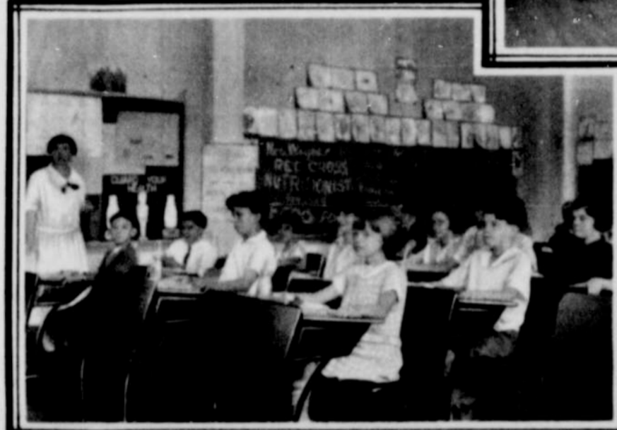
American Red Cross nutritionist teaching school children the importance of proper foods

In communities that never had the benefit of family work the experienced Red Cross worker serves those who need friendly council and assistance