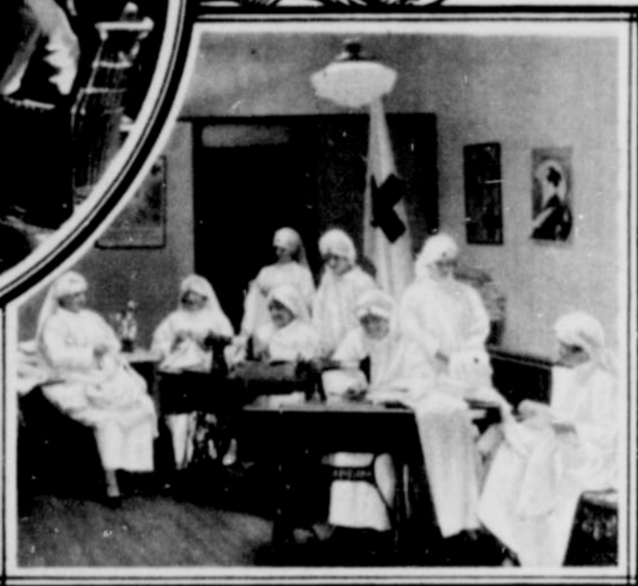
A Red Cross Community Work Room where eighteen organizations of women volunteers fill all Red Cross quotas and also provide surgical dressings and garments for local institutions