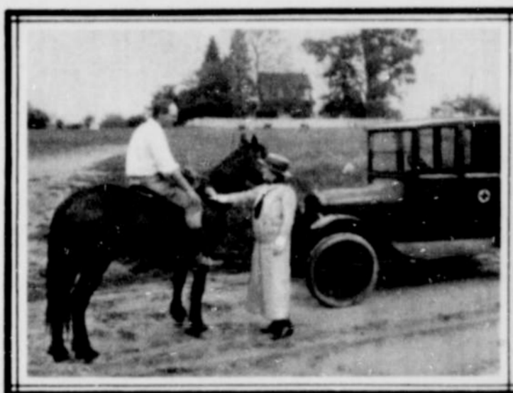
This farmer has found the Red Cross Public Health Nurse an ally and a help in his home problems—she is the "friend in need" to all the community