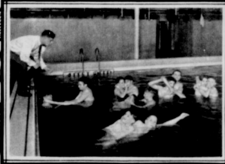
A class of boys learning how to rescue drowning persons by Red Cross methods