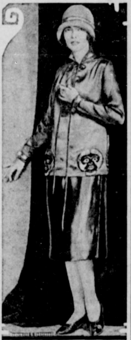
Tunic in Pencil Blue Satin, With Merry Clown Decorations.

Almost every girl has a natural liking for pretty clothes and she often wears them with an air that forecasts future success when she takes her place in the grown-up world. It is