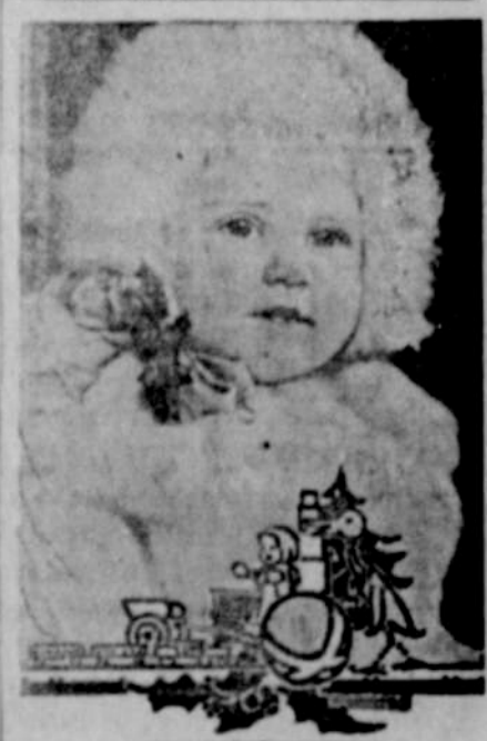
Subscribe for the Tribune