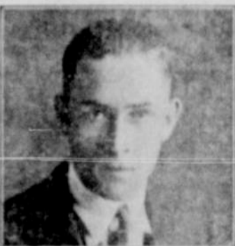
MAURICE WHITE "Buck"