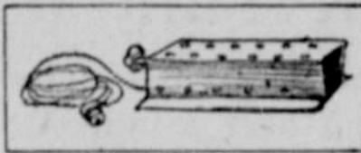
Hot Brick Device.

If there is electrical connection to be garage there should be no trouble starting off in the morning. The "hot rick" method electrified may be used