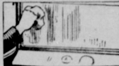
Keep Off Rain or Snow.

To prime the engine for starting, pour a mixture of high test gasoline and ether into each cylinder through the priming cups at the top. Then