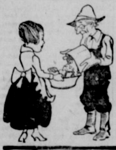
Buy Local Food.