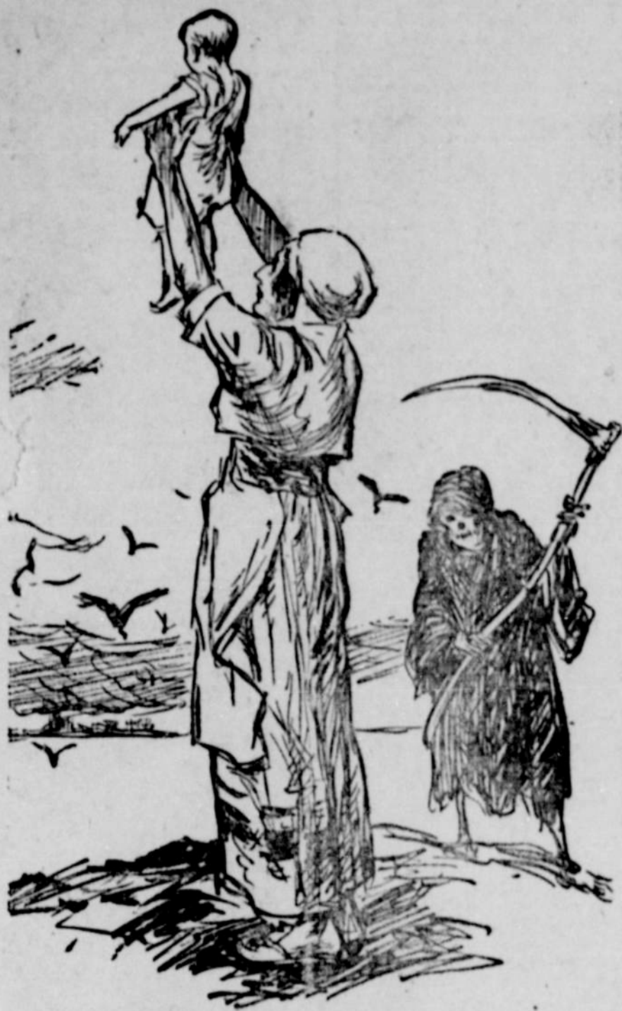
THE NEAR EAST TO CIVILIZATION "SAVE MY CHILDREN"