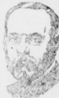
JOHN PHILIP SOUSA And His Band, Sings "All the vim, energy and enthusiasm we put into the playing of 'The Stars and Stripes Forever' we find in the tobacco use of Tuxedo."

The March King's stately name is known wherever music holds its own, wherever drums and cymbals throb, and mark how people smile thereat; they know what Sousa's music is; it's melody without the fizz; it's full of energy and pep, and makes old graybeards dance a step; they hear the sound of marching men, of chargers trotting down the glen, the shock of battle and the roar, and billow: beating on the shore. And Sousa when he would compose that music which the whole world knows, fills up his pipe with good old "Tux" (name 't'other brands, and he says, "Shucks!"). Tuxedo is the smoke of men who do big things with lyre or pen, who make the old world's wheels go round, whose names will down the ages sound.