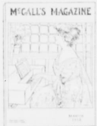
SOLVE YOUR CLOTHES PROBLEM

For Style For Pleasure For Profit Read McCall's The Fashion Magazine