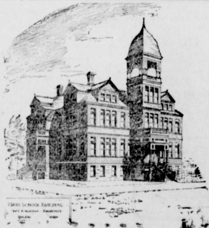
SCIO SCHOOL BUILDING B. R. L. C.

The Rexall Stores are America's Greatest Drug Stores