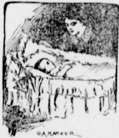
WHERE'ER THE BABE AND CRADLE ARE AND PARENTS WATCHING NEAR.

It is not set, the Bethlehem star, But hovers full and clear Where'er the babe and cradle are And parents watching near, Where'er the angel lips of love Bring tidings of great joy, Where'er a mother tends above Her darling firstborn boy.