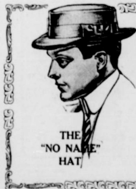
THE "NO NAME" HAT