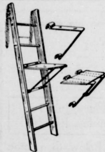
THE ADJUSTABLE STEP.

House painting is very easily done by painters having their own scaffolds, but a person desiring to do his own work will have only a ladder to take place of a scaffold. To paint and stand on the rungs of a ladder all day will tire one's feet. As the writer had to do some painting and a ladder was the only thing obtainable to climb upon, a flat detachable step was made to put upon the rungs of the ladder to stand on the same as a scaffold. The step can be adjusted to any part of the ladder for the painter to stand upon and paint a surface within easy reach. Two irons are bent V-shaped,