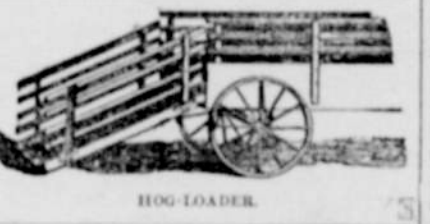
HOG-LOADER. slipping. At the upper end the sides are notched to fit on the bottom of wagon box and two staples on each side complete the fastening. The construction of the rack is shown in the illustration.

A loader for attachment to the wagon is made of two pine boards six inches wide by nine feet long, fastened together by the three cross-pieces of proper length so that they will fit between the sides of the wagon box. A floor is laid on these cross-pieces and short strips of lath to prevent hogs