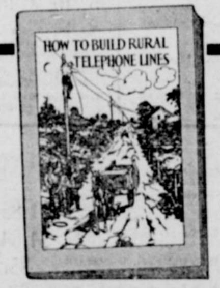
This Book Sent Free

Stockholm, Christiania, Berlin and London, in the order named, have the lowest death rates of all the cities of Europe.