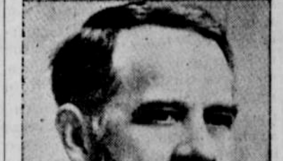
HENRY G. DAVIS Democratic Nominee for Vice President