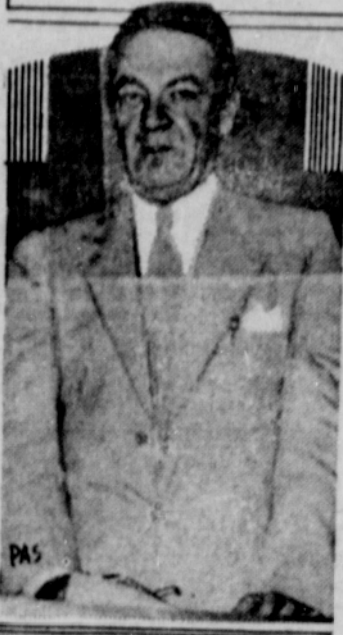
It is action now in the U. S. industrial recovery program and the man of the hour is Gen. Hugh S. Johnson (above). This photo was taken as Gen. Johnson opened the hearings on industrial codes submitted by different industries.