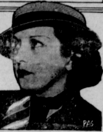
Estelle Taylor, former wife of Jack Dempsey, threatened to subpoena "half Hollywood" to prove she never touches intoxicating liquor, in her suit for $150,000 damages in an auto accident. That issue was "tripped."