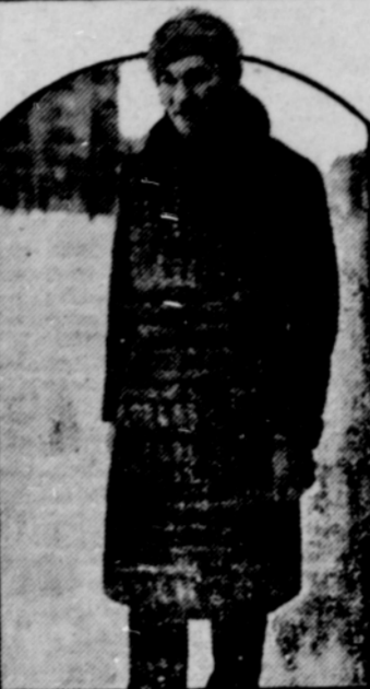
Debonair James J. Walker, Mayor of New York, in his sub-arctic costume at the Winter Olympic Games, Lake Placid, New York.